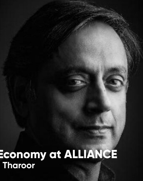
Creative Economy at ALLIANCE by Dr. Shashi Tharoor