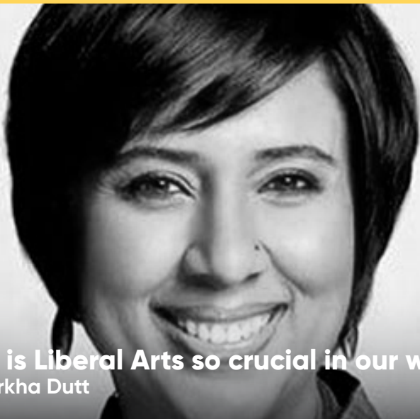
Why is Liberal Arts so crucial in our world? by Barkha Dutt

"The Ideal Liberal Arts Programme for the 21st Century at Alliance: from Ivy League Faculty to Multidisciplinary Training from the Sciences to the Arts".